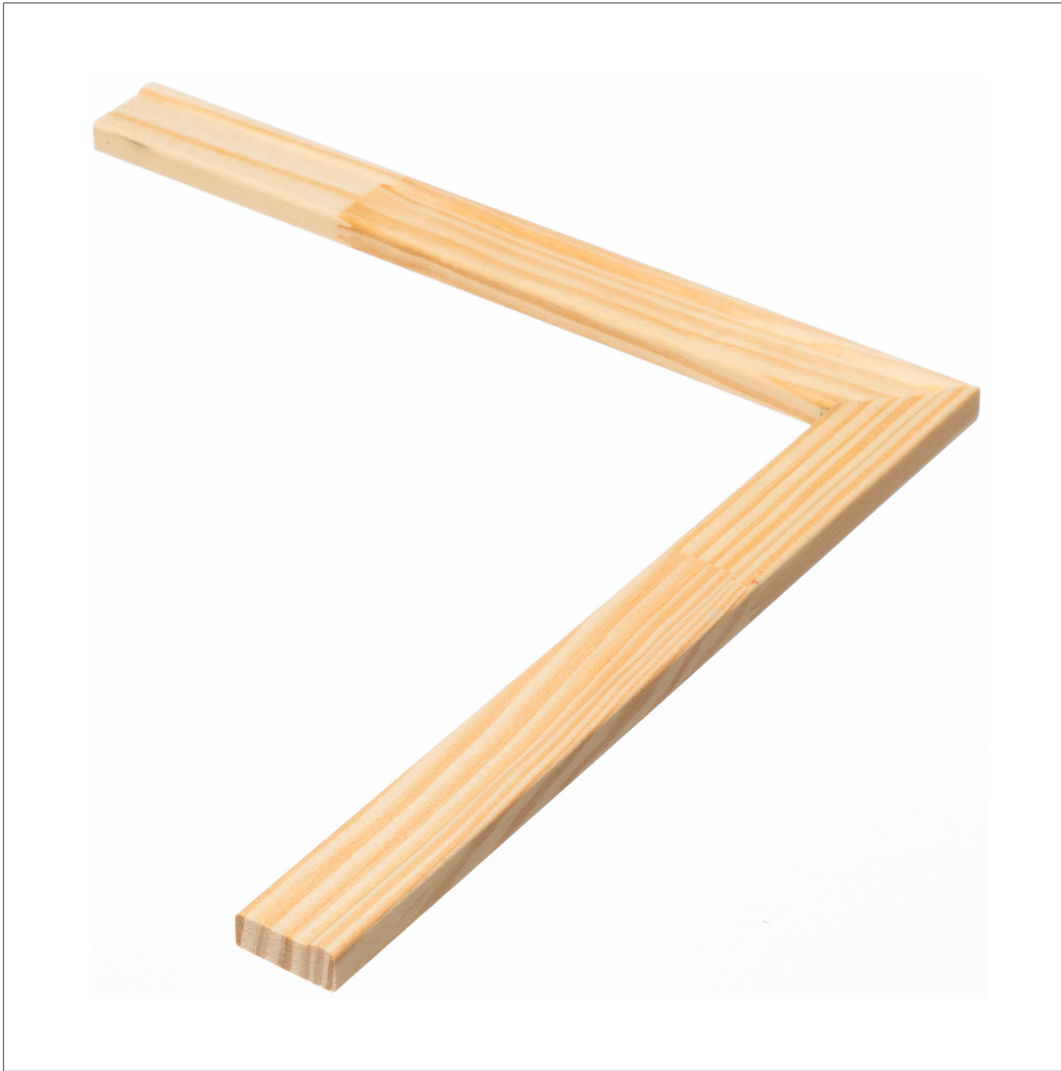
3D - Top Perspective