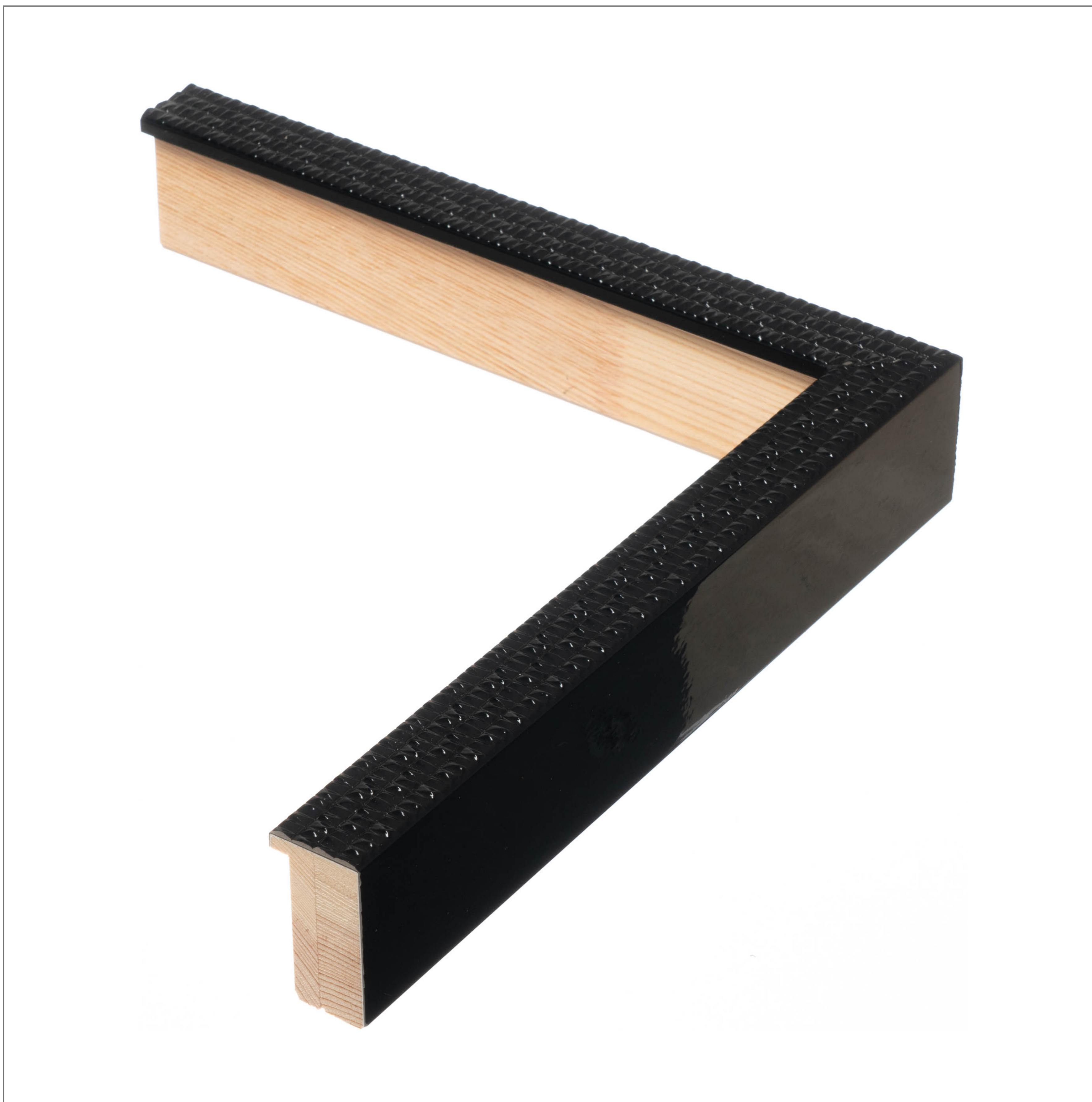
3D - Top Perspective