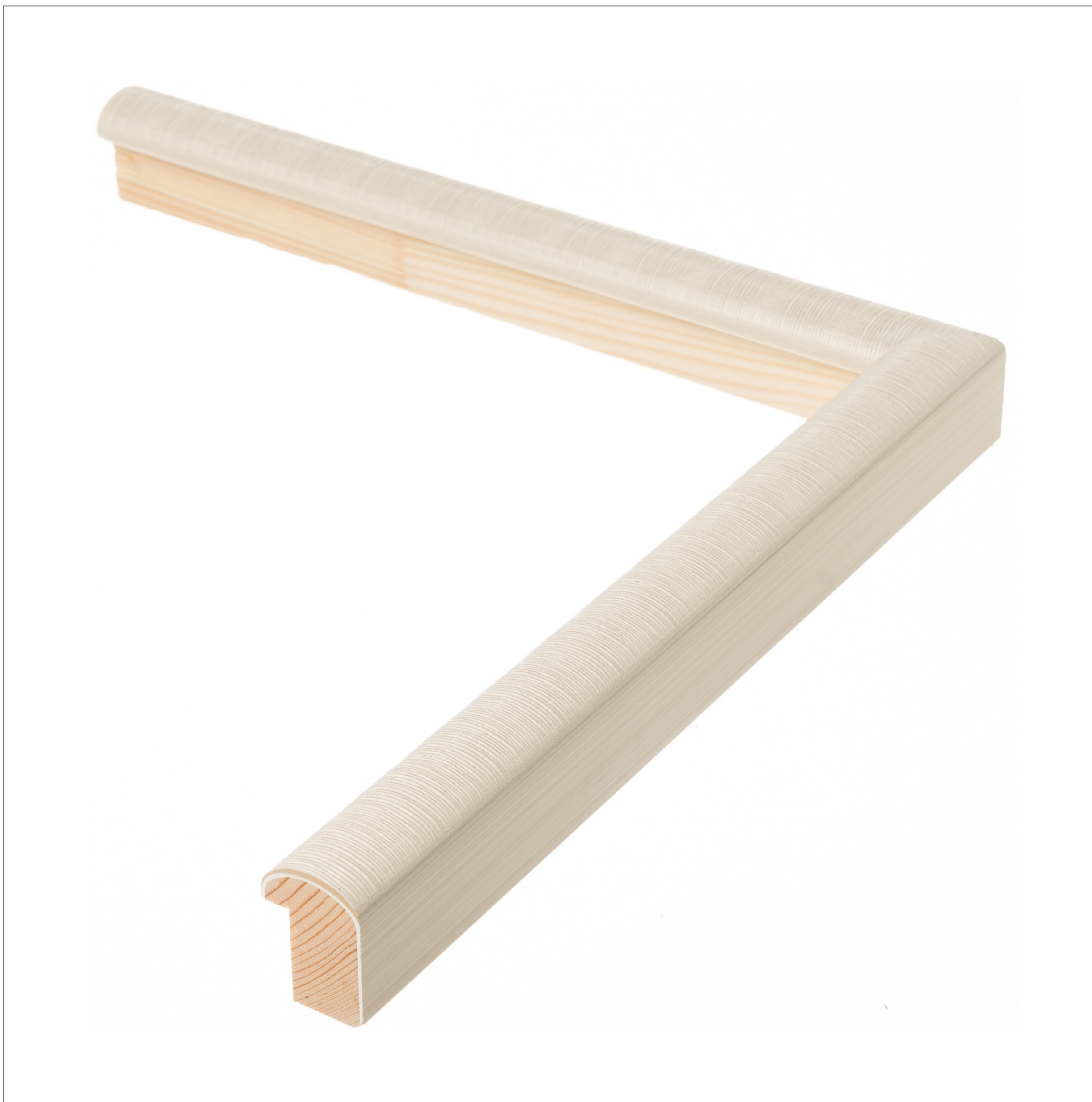
3D - Top Perspective